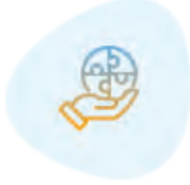
Manufacturers & Distributors