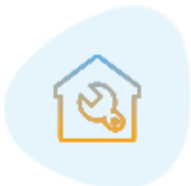
AEC: Architecture, Engineering & Construction